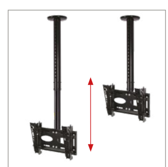
Quick and easy 'push button' height adjustment in 25mm increments