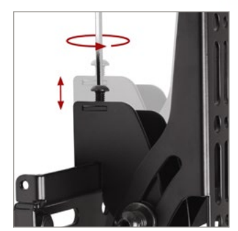
Levelling screws allow adjustment of the screen height once mounted