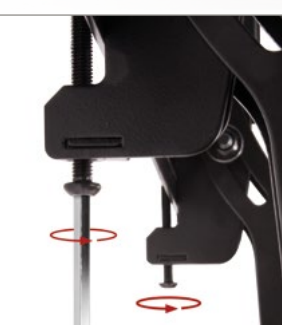
Security locking screws and Allen key provide a secure installation